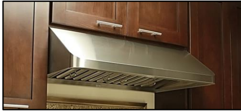
Under Cabinet Style