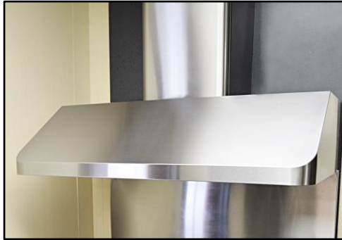
Wall Mount Style (Duct Cover is included)